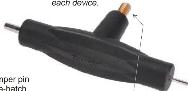
HY-3 grip tool, supplied with each device.

HY-3 pack with neutral fog intended for and accepted by the 240 demonstration devices. Indicated by blue canisters and the label mark DF (Demo Fog). The purchase price for these is the same as for the regular (RF) cassette, but the refill price is 50% lower.