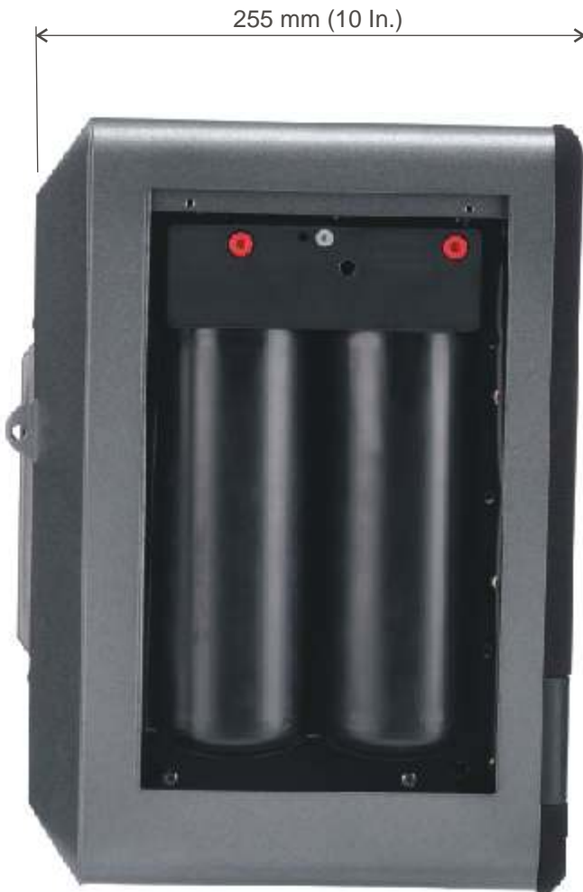
BANDIT 240 side view with installed HY-3 pack and side hatch open.

A fully filled HY-3 pack contains 1.4 liter (1400 ml) of HY-3 liquid. Ejecting fog consumes approximately 28 ml of liquid per second. So in total approx. 50 seconds of fog ejection is available in a single HY-3 pack. The device electronics communicate continuously with the HY-3 pack electronics and based on given parameters it permanently calculates how much liquid remains in the HY-3 pack. When the supply of HY-3 liquid depletes to 30% the device will "ask" for a refilled HY-3 pack.